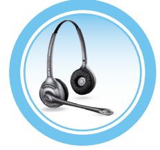
→ CS361N SupraPlus Wireless Binaural with Noise-Canceling