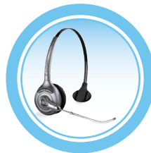
→ CS351 SupraPlus Wireless Monaural with Voice Tube